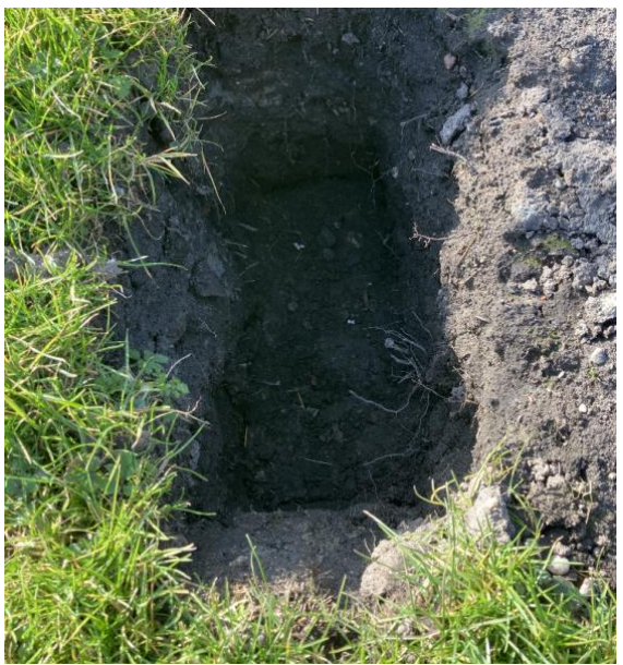
Dig a hole +/- 30 cm wide, to the desired measuring depth