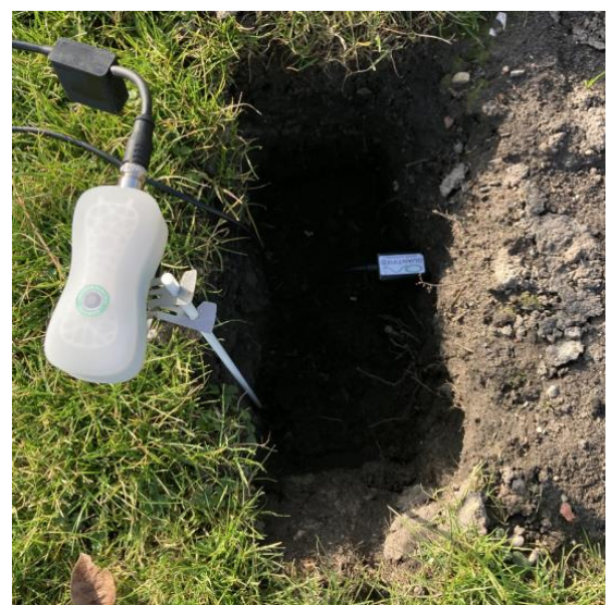
Place the Firefly sensor on the stick