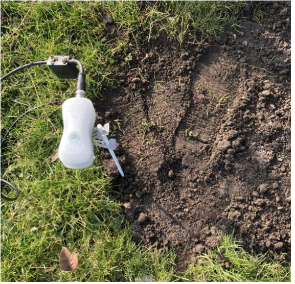
Gently bring back the soil and gently compress till the surface is even.