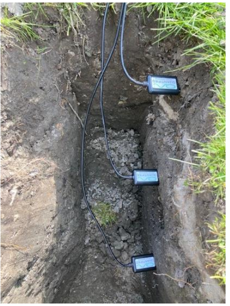
Insert the Poseidon pins firmly in the sidewall